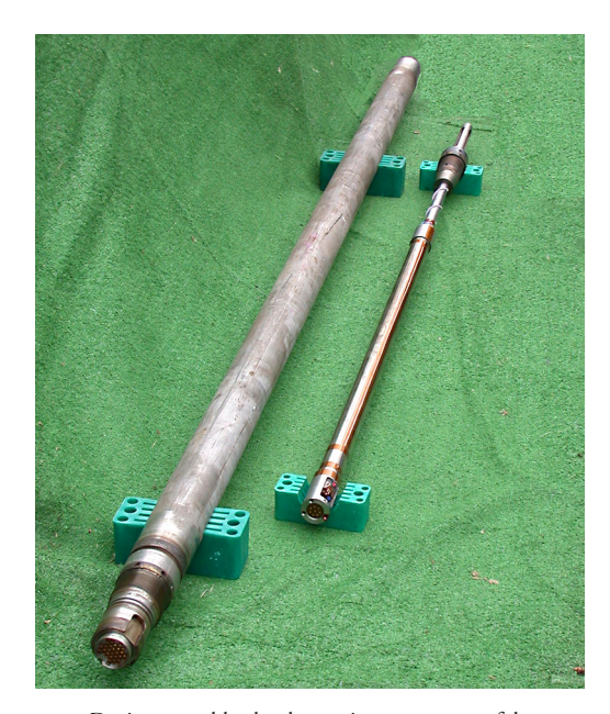
During assembly, the electronic components of the HTT (right) are placed inside the pressure case.