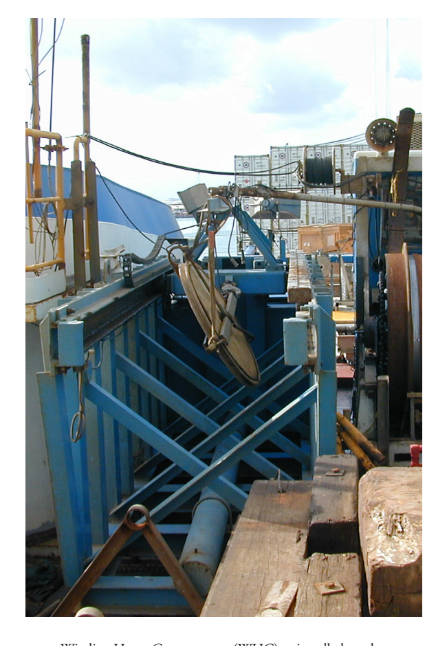
Wireline Heave Compensator (WHC) as installed on the JOIDES Resolution .